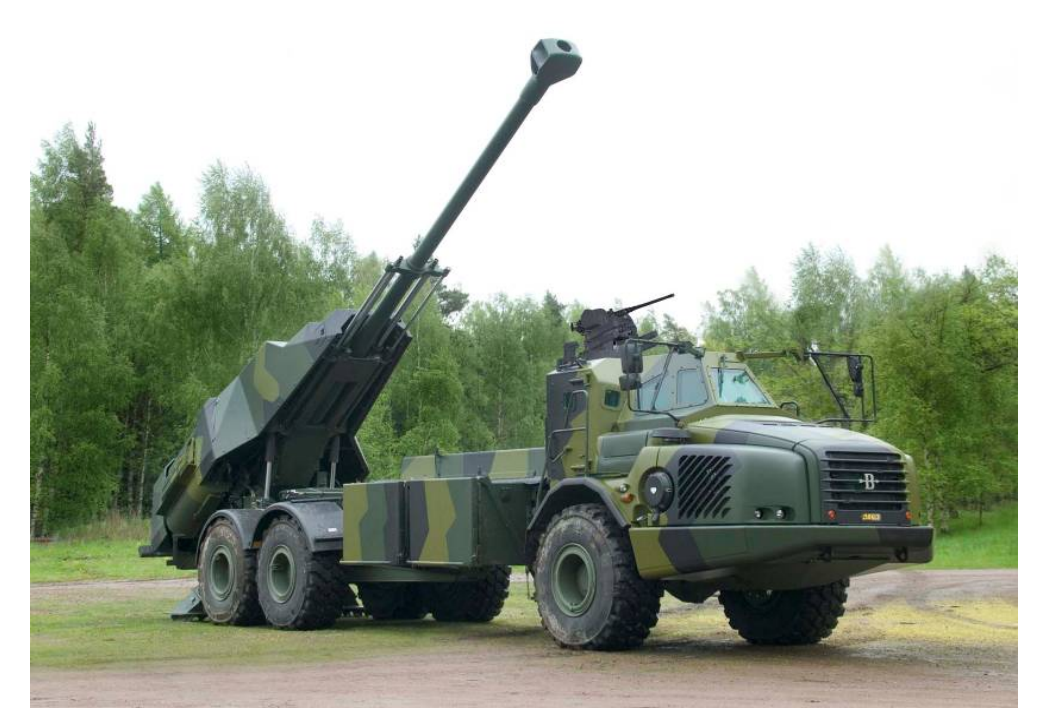
ARCHER Artillery System 08

GUDN is a stable salt of dinitramide. In relation to the better known dinitramide (ADN) the properties of GUDN are quite different. GUDN does not melt, is poorly soluble in water has reduced water solubility and is significantly more thermally stable then ADN. This, together with a very low sensitivity, makes it an excellent component for gun-propellant manufacturing. GUDN is often referred to as FOX-12 and was first synthesized and presented by the Swedish FOI. Although GUDN is a fairly new component in gun-propellant formulations, it is not an entirely new explosive. It is already in use in automotive safety devices and is in large scale production by EURENCO Bofors.