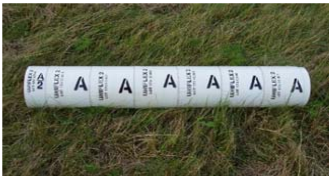
Uniflex 2 MCS

length module and one half length, both containing the same propellant. Adding a half module will double the number of increments and thereby increase fire power in terms of Multiple Round Simultaneous Impact (MRSI).