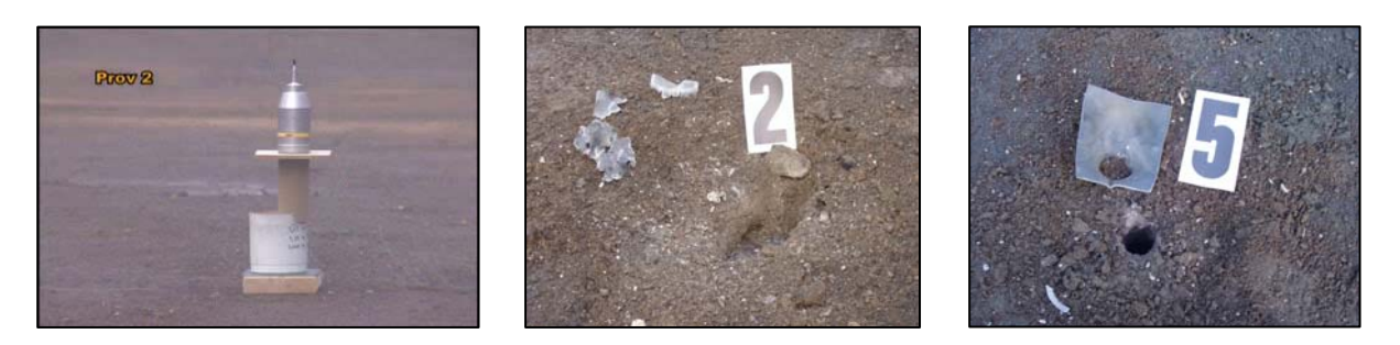
Jet-impact test with the CG 80 mm war-head

The picture down to the left shows the test set-up with the shaped charge on top and the modular charge standing on a witness plate. Between is a tube to define the stand-off. The pictures down to the right shows the witness plate after the test with the module containing the single-base propellant (2) and the module containing the GUDN based propellant (5). The pictures clearly show the difference in response between the two propellants. In the case of the single-base propellant, the witness plate was heavily fragmented due to the violent reaction. Continued IM-testing will be performed during 2006 to further verify the IM-signature.