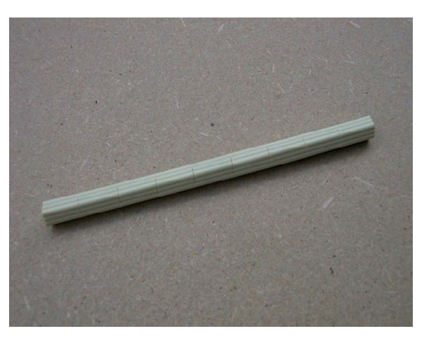
Kerfed propellant stick

Since GUDN generates a large amount of gas at a small energy out-put during combustion, the gun performance of the GUDN-based propellant equals that of a single-base propellant, but burns with a considerably lower flame temperature. The solvent-less manufacturing process for double-base propellants is currently used for the GUDN propellant. The picture to the right shows the kerfed, 19perforation, rosette-geometry of the GUDN-based propellant necessary to increase the loading density in the modules.